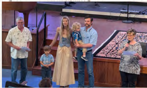
Baby Blessing/Parent Dedication