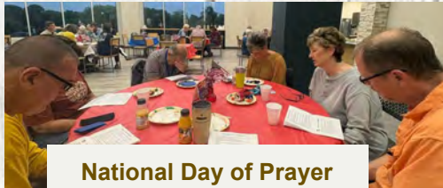
National Day of Prayer