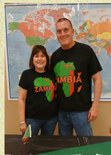
Dominican Republic Reunion