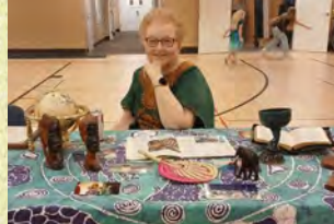
Family Gathering & Mission's Fair