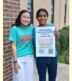
Sweets & S'more Fundraiser a Success!