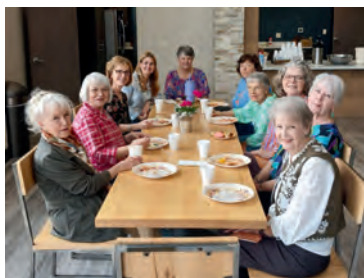
Women's Bible Study Group Lunch