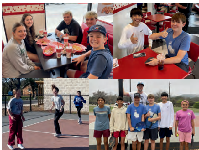
Fun in the Morning Sun