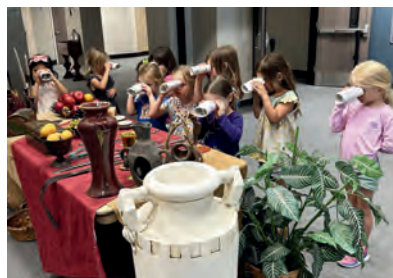
CDO children exploring the Victor display