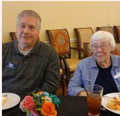
Staff lunch at Sage Park