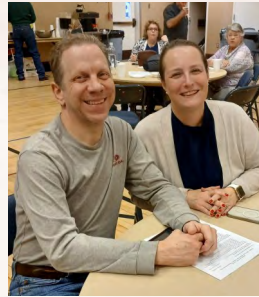
Family Gathering/Chili Cook-off