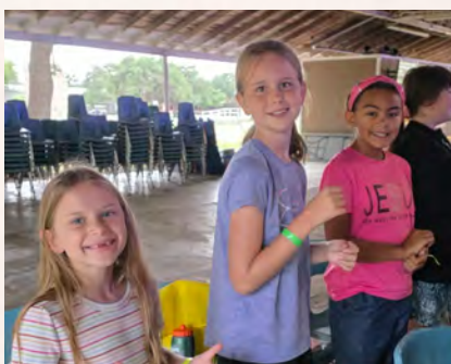
Kid's Camp 2025