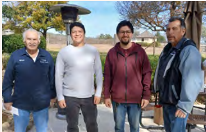
Our awesome Facilities Manager & Custodians!