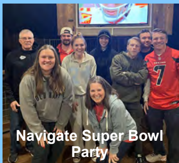
Navigate Super Bowl Party