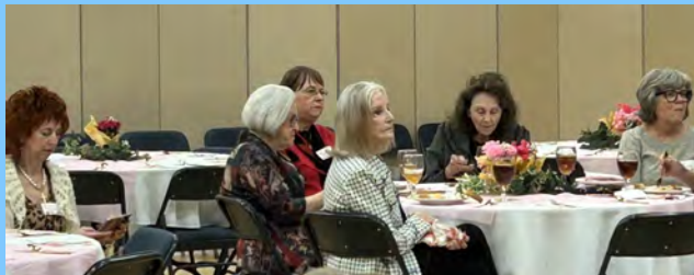
Women's Ministry Conference