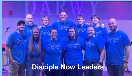
Disciple Now Leaders