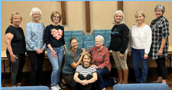
HOPE for Mommies