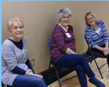
Kitchen Team taking a break