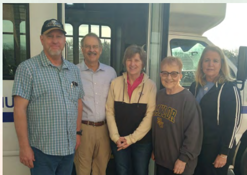
Thailand Mission Trip Team