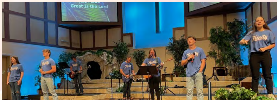
Youth Praise Team leading worship