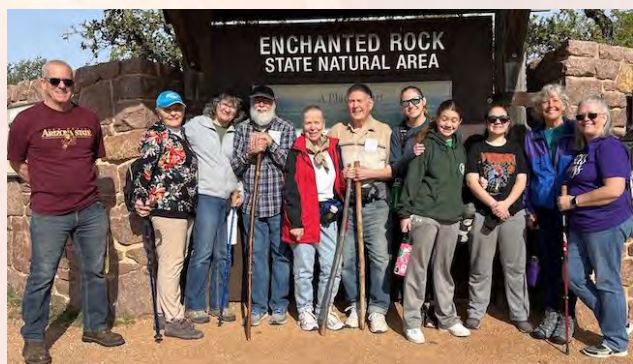
Genesis 1 hikers at Enchanted Rock