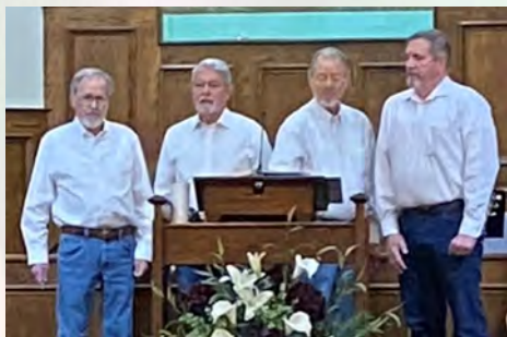
Men's Quartet at HCBA Sing Along