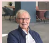
Prime Time Game Day