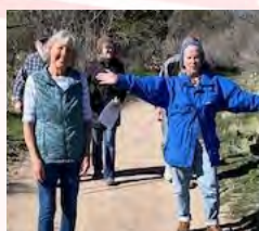
Genesis 1 trip to South Llano State Park