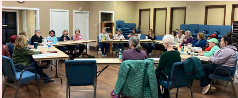
Women's Thursday Evening Bible Study