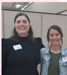
Women's Ministry Kick-off Luncheon