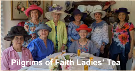
Pilgrims of Faith Ladies' Tea