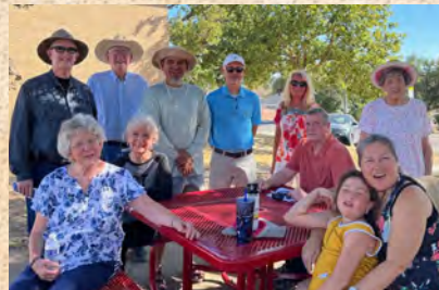
Prayer Walking at the Schools