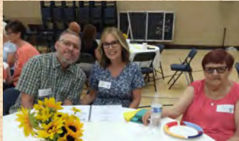
New Member Reception