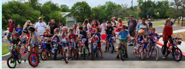
July 4th Neighborhood Parade