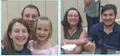
Family Gathering Fun!