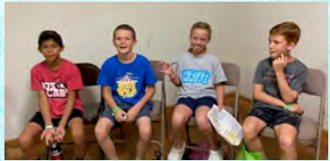
Preteen Camp 2023!