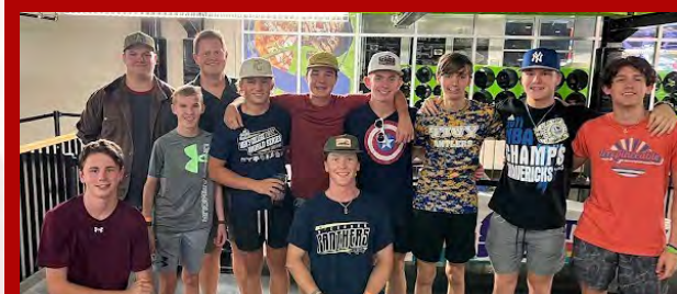
High School Guys & Girls Trips