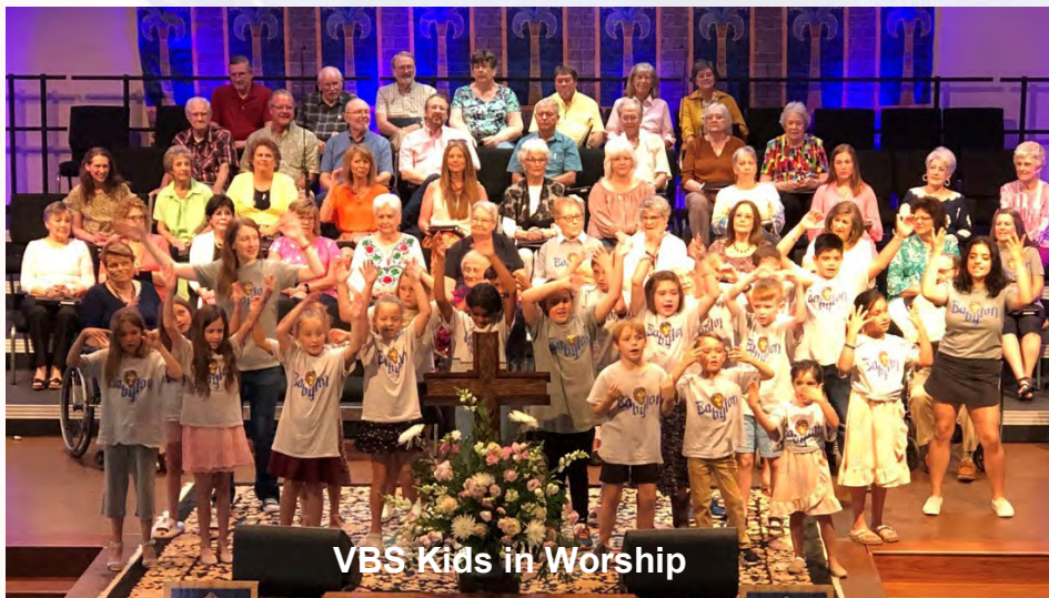
VBS Kids in Worship