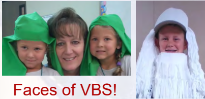
Faces of VBS!