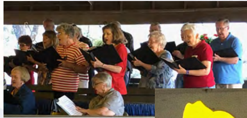
Cowboy Camp Meeting