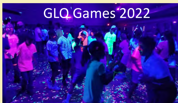
GLO Games 2022