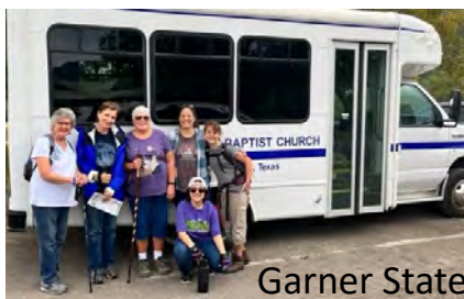
Garner State Park