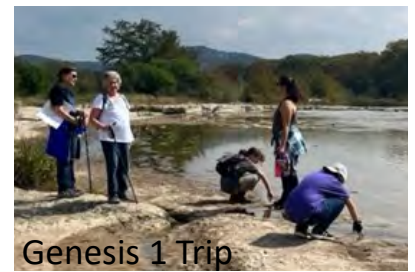
Genesis 1 Trip