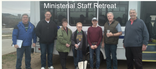
Ministerial Staff Retreat