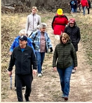
Genesis 1 Trip to Llano State Park