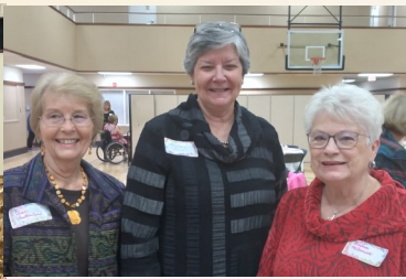
Women's Ministry Kick-Off Luncheon