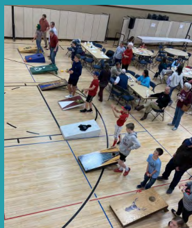
Chili Cookoff & Cornhole Tournament