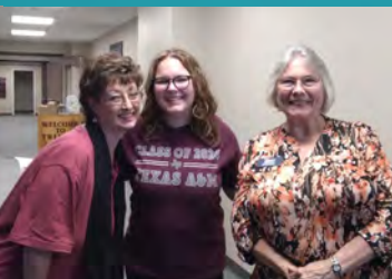
Donuts & Fellowship!