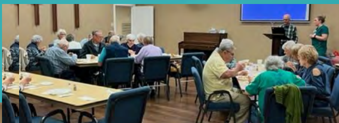
Prime Time Dinner