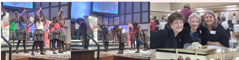
Kenyan Children's Choir