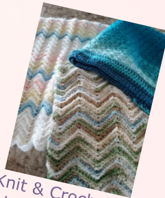
Knit & Crocheted baby blankets