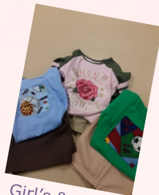
Girl's & Boy's short sets