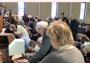
Prayers for Ukraine