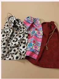
Shoe bags for First Blessing