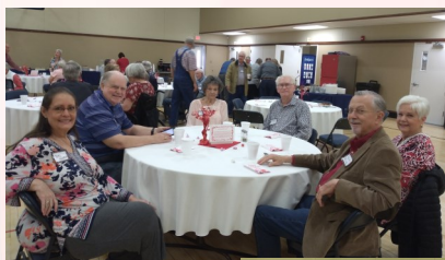
Women's Ministry Kick-off Luncheon