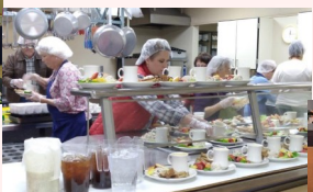
Our amazing kitchen crew!