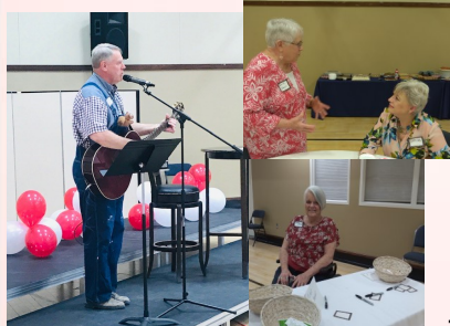
Prime Time True Stories & Tall Tales