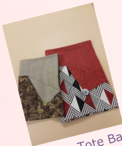
Walker Tote Bags