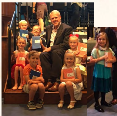
Bibles were presented to our 1st graders 9/12.