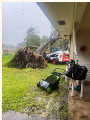
TBM Chainsaw Gang at work after Hurricane Ida.