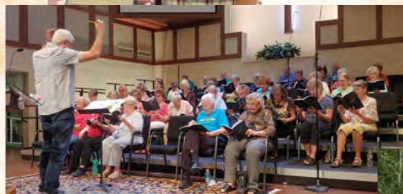
Christmas Choir Rehearsals have begun!