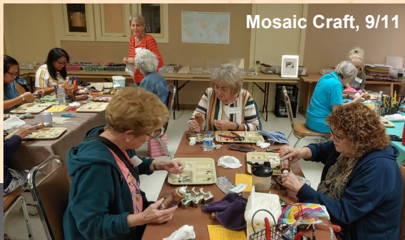
Mosaic Craft, 9/11