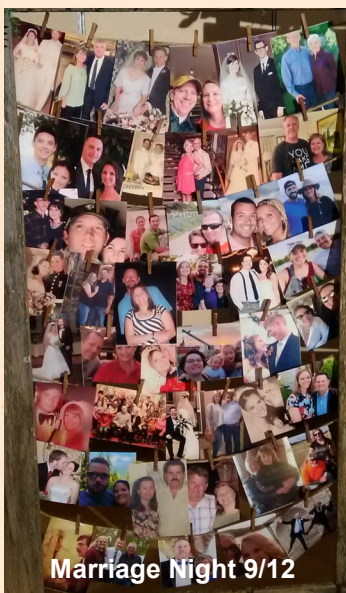
Marriage Night 9/12